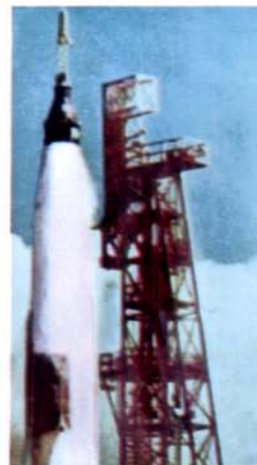
YOU WON'T WANT TO MISS A TOUR OF THE CAPE KENNEDY SPACE PORT. THE BUSES LEAVE AT SCHEDULED INTERVALS AND YOU CAN BOARD ONE JUST 3 MILES FROM HERE.