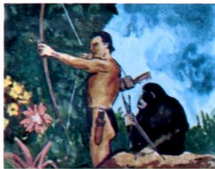
TARZAN'S CHARACTER IS BORN ANEW AT THE TROPICAL WONDERLAND; JUST ONE MILE AWAY.