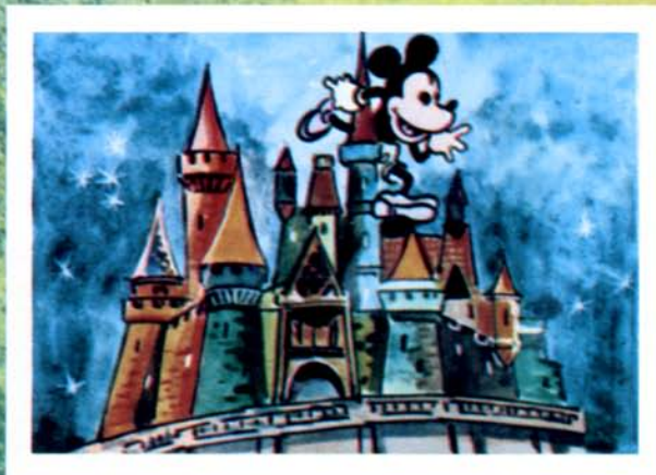
DISNEYWORLD IS A COMFORTABLE 30 MINUTE DRIVE TO REACH AND NO TRAFFIC TO FIGHT. THE ROAD LEADS DIRECTLY TO THE DISNEYWORLD DOORSTEP.